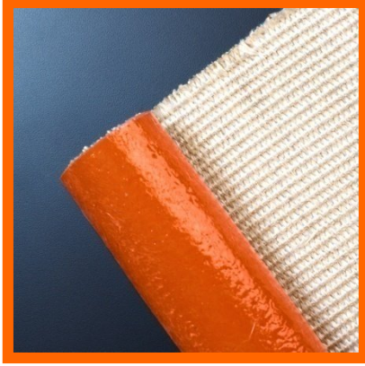
Heavy Duty 98 Coated 1 Side Heavy Duty 50 Coated 2 Side