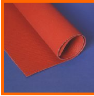
Medium Duty 22 & 32 Coated 2 sides