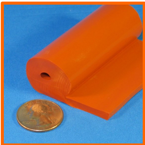
Extruded “P” Tadpole Gasket Seal