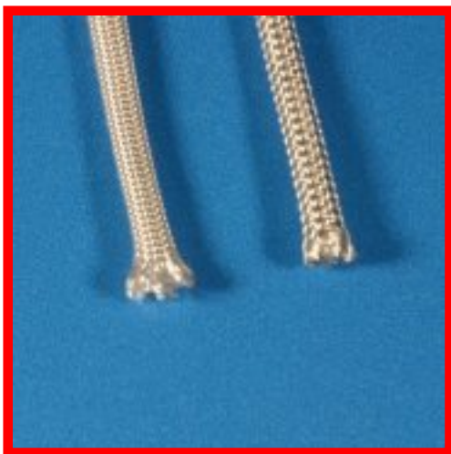
Left: Standard Wall Thickness Right: 1/32" Heavy Wall Thickness

Heat Treated or Heat Treated with Binders