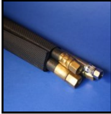
Nylon Abrasion Protection Sleeve Page 6-1