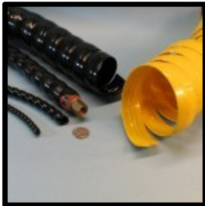
Tuff-Wrap™ Hard Shell Abrasion Protection Spiral Wrap Page 6-10