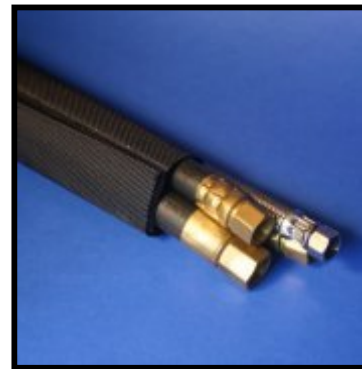
Abrasion Protection Sleeve with Velcro. Page 6-3